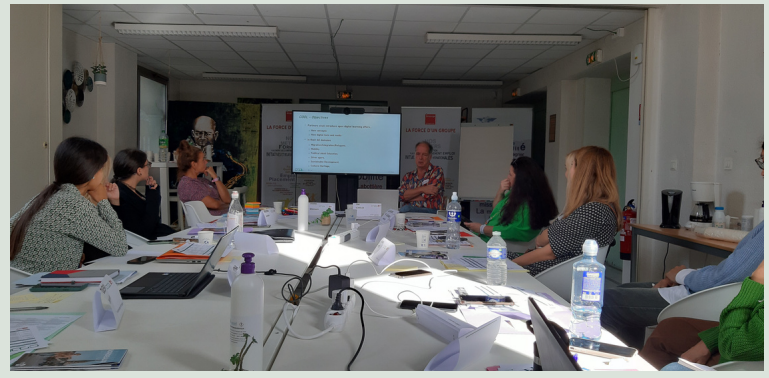
Identification of challenges to be tackled

Divided into 3 teams, the trainers worked on 3 projects and designed prototypes and tools that will be displayed in an exhibition mixing real and virtual objects.